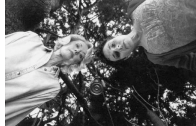
Tea with Grandma